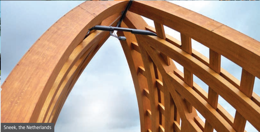
Sneek, the Netherlands