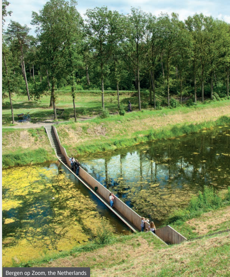
Bergen op Zoom, the Netherlands

Imagine a wood that can replace increasingly scarce tropical hardwoods, treated woods and less sustainable materials in new and existing outdoor applications. Imagine a wood that will act as a better carbon sink during its extended life span and can be safely recycled at the end. Such a wood exists. It is Accoya® wood: the world's leading high technology wood.