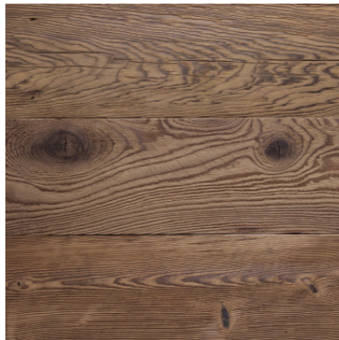
REED SOLID - SKU #EN-750325 UNFINISHED