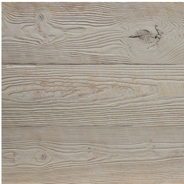
BARN GREY SOLID - SKU #EN-750326