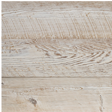
BUCOLIC BLANC SOLID - SKU #EN-750317