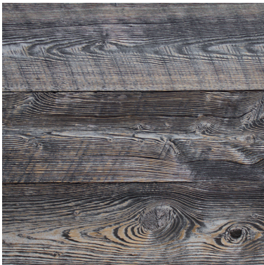
BLACK & TAN SOLID - SKU #EN-750327