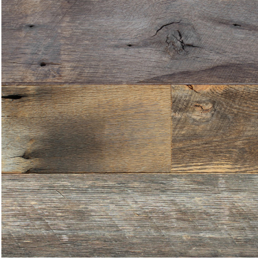
WEATHERWORN SOLID - SKU #EN-750315

WEATHERWORN SOURCE: Reclaimed Barn Siding