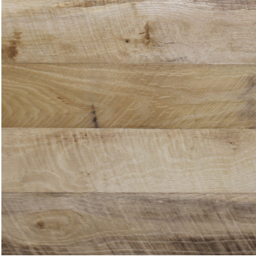
JAVELIN SOLID - SKU #EN-750324 ENGINEERED - SKU #EN-625324

JAVELIN SPECIES: Antique Reclaimed Oak (Mix of Red/White Oak) GRADE: Rustic FINISH: Matte Polyurethane Janka Hardness (ASTM D 1037): 1,325 JAVELIN is Antique Reclaimed Oak that has been skip planed, bleached and finished with a durable polyurethane top coat making for a beautifully rustic floor or wall cladding. Available SOLID or ENGI-NEERED.