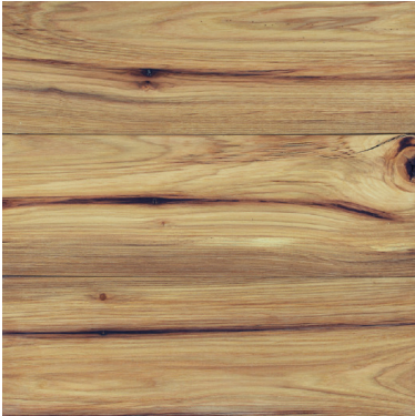
STOUT SOLID - SKU #EN-750322

JAVELIN SPECIES: Antique Reclaimed Oak (Mix of Red/White Oak) GRADE: Rustic FINISH: Matte Polyurethane Janka Hardness (ASTM D 1037): 1,325 JAVELIN is Antique Reclaimed Oak that has been skip planed, bleached and finished with a durable polyurethane top coat making for a beautifully rustic floor or wall cladding. Available SOLID or ENGI-NEERED.