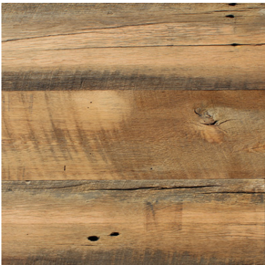
OLD SCHOOL SOLID - SKU #EN-750319

OLD SCHOOL SOURCE: Reclaimed Oak Barn Siding - Skip Planed