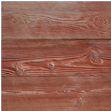
RUSTIC ROUGE SOLID - SKU #EN-750316