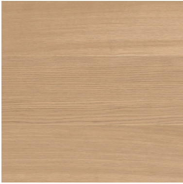
RHAPSODY Finished with matte polyurethane Select Grade: ENG 3/4" (6mm) X 5" wide ENG 3/4" (6mm) X 7" wide