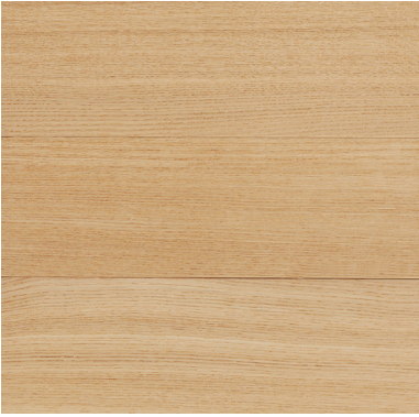
COPPELIA Finished with matte polyurethane Select Grade: ENG 3/4" (6mm) X 5" wide ENG 3/4" (6mm) X 7" wide