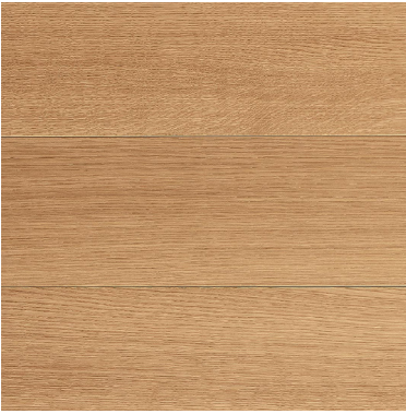
BRAVURA Finished with matte polyurethane Select Grade: ENG 3/4" (6mm) X 5" wide ENG 3/4" (6mm) X 7" wide