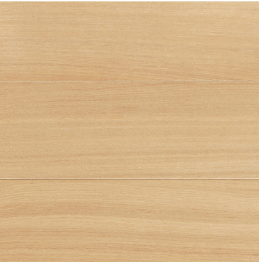
VIRTUOSO Finished with matte polyurethane Select Grade: ENG 3/4" (6mm) X 5" wide ENG 3/4" (6mm) X 7" wide