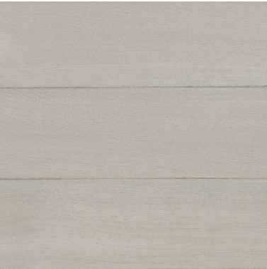
BAYADER Finished with hardwax oil Select Grade: ENG 3/4" (6mm) X 5" wide ENG 3/4" (6mm) X 7" wide