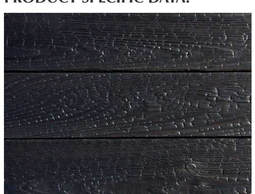
MOYASU - CYPRESS SOLID - SKU #CH-750202