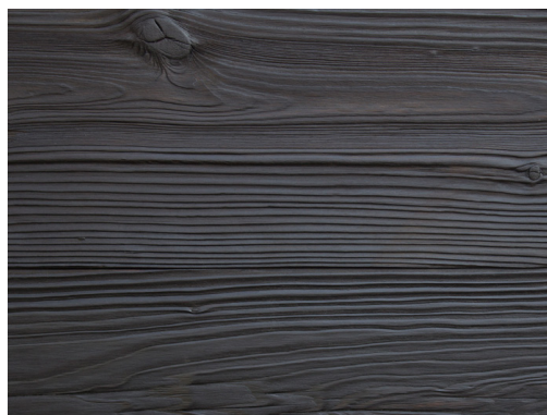
KINOKO - reclaimed hemlock SOLID - SKU #CH-750232