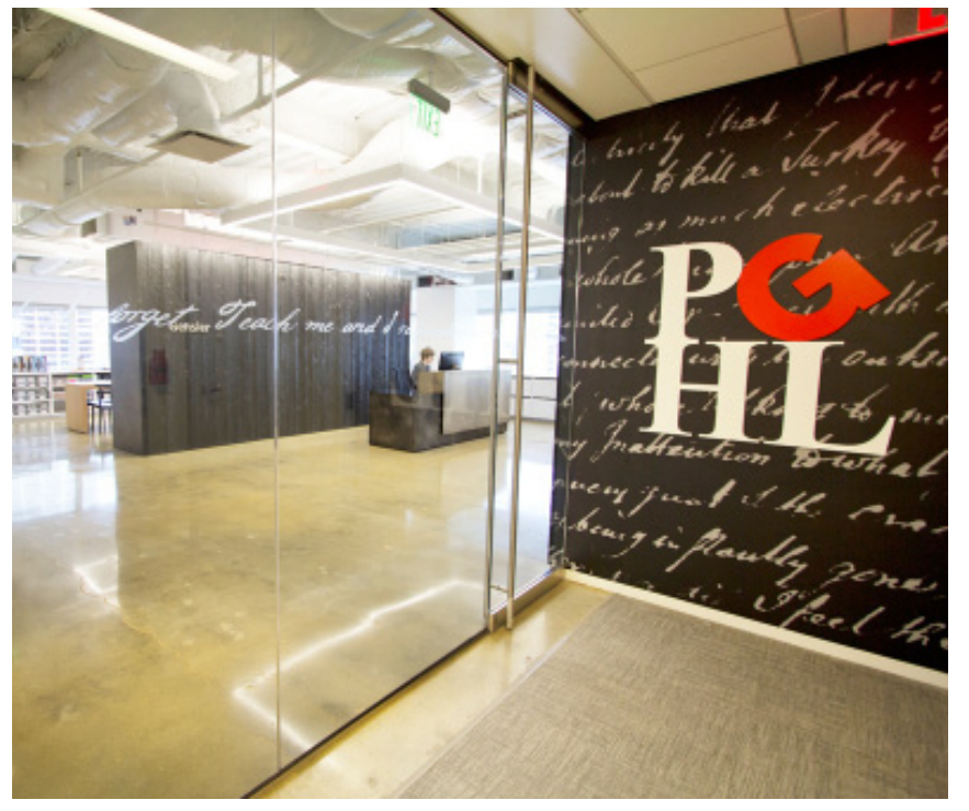
Photo Disclaimer: Project and product photos are meant to be a general guide to product appearance only. Due to our handcrafted process and wood being a product of nature, the color, grain pattern, character and profile will vary between individual boards on a project and will never be an exact match.

Janka Rating from similarly tested products - expected to be close to actual measurements of reSAWNTIMBER co.'s products. Data from Forest Products Laboratory (FPL) General Technical Report (GTR) 190 - expected to be close to actual measurements of reSAWNTIMBER co.'s products.