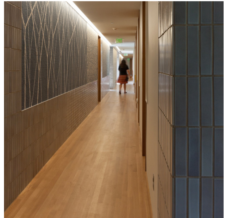
Photo Disclaimer: Project and product photos are meant to be a general guide to product appearance only. Due to our handcrafted process and wood being a product of nature, the color, grain pattern, character and profile will vary between individual boards on a project and will never be an exact match.