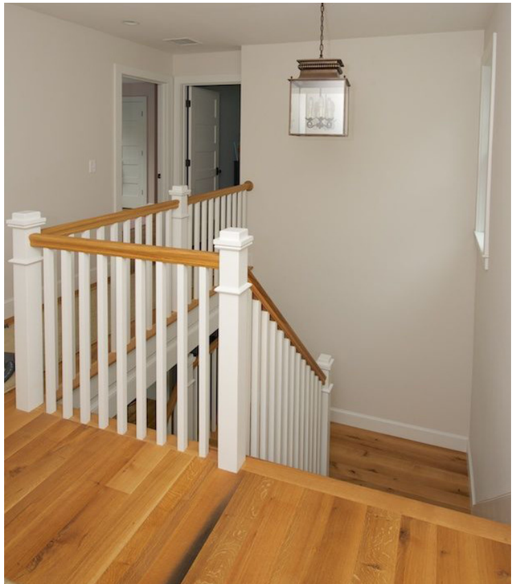
Photo Disclaimer: Project and product photos are meant to be a general guide to product appearance only. Due to our handcrafted process and wood being a product of nature, the color, grain pattern, character and profile will vary between individual boards on a project and will never be an exact match.