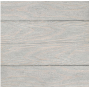
EIGER 1C SHOWN WEATHERED 2 MONTHS