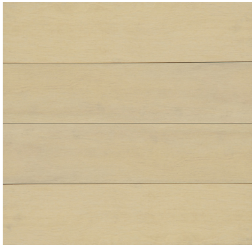
MAHO 1C SHOWN WEATHERED 2 MONTHS