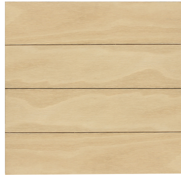
HURON 1C SHOWN WEATHERED 2 MONTHS