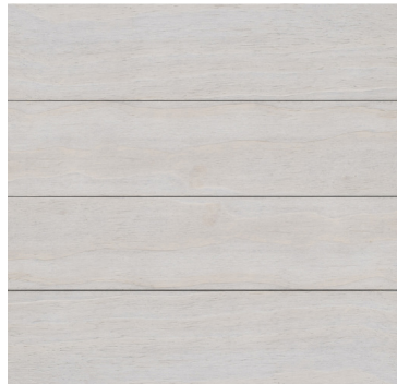
CUYAHOGA 1C SHOWN WEATHERED 2 MONTHS