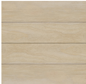
PALAWAN 1C SHOWN WEATHERED 2 MONTHS

Ingredients: Water, refined plant oil, medium oil alkyd, zinc & lead free driers, low VOC co-solvent, moldicide, earth oxide pigment.