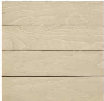
PALAWAN 2C SHOWN WEATHERED 2 MONTHS

Ingredients: Water, refined plant oil, medium oil alkyd, zinc & lead free driers, low VOC co-solvent, moldicide, earth oxide pigment.