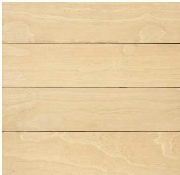
MAHO 2C SHOWN WEATHERED 2 MONTHS