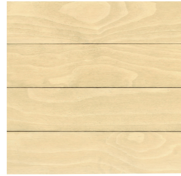
HURON 2C SHOWN WEATHERED 2 MONTHS