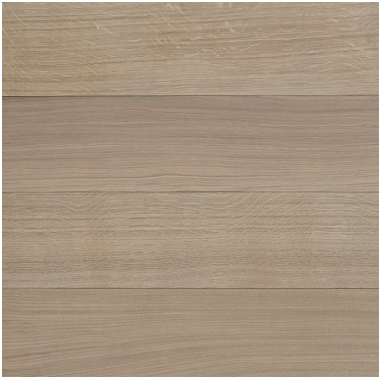
BRINATO Finished with Matte Polyurethane Select Grade: ENG 3/4" (6mm) X 5" wide ENG 3/4" (6mm) X 7" wide