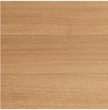
BRAVURA Finished with Matte Polyurethane Select Grade: ENG 3/4" (6mm) X 5" wide