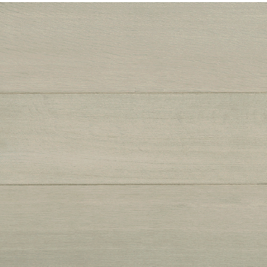
BAYADER Finished with UV Oil Select Grade: ENG 3/4" (6mm) X 5" wide