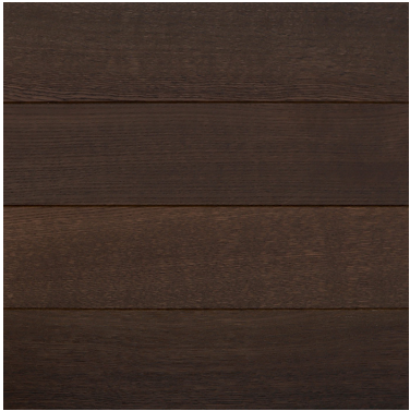
CAMPAGNA Finished with Matte Polyurethane Select Grade: ENG 3/4" (6mm) X 5" wide