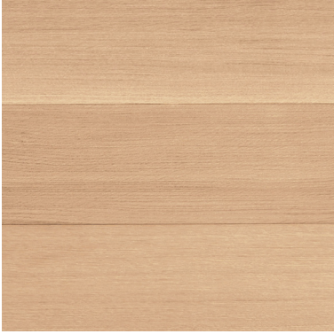
GISELLE 2.0 Finished with Matte Polyurethane Select Grade: ENG 3/4" (6mm) X 5" wide