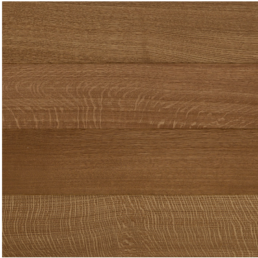
PARAMITO Finished with Matte Polyurethane Select Grade: ENG 3/4" (6mm) X 5" wide

Photo Disclaimer: Product photos are meant to be a general guide to product appearance only. Due to our handcrafted process and wood being a product of nature, the color, grain pattern, character and profile will vary between individual boards on a project and will never be an exact match.